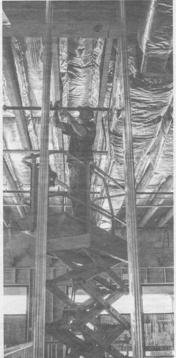
Ian Gunderson sets up fire sprinklers this week at the site of what will be the newest Good Egg restaurant, on Happy Valley Road in Phoenix.

Several local residents who were shopping at Safeway said they have seen the Good Egg restaurants and were unaware that one was coming to their neighborhood. Some were looking forward to trying it out.